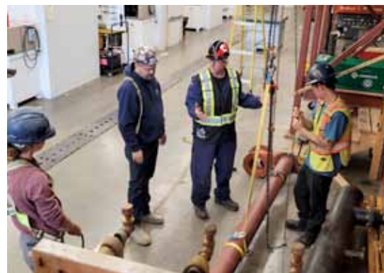
Introduction to Rigging Principles