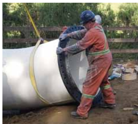
Bro. Scott Whitehouse

This past summer members completed work on the Catalyst Pulp mill's water pipeline that included 6 spreads in 3 different locations. Also recently completed was an upgrade at the Shell Fuel Tank Farm at Bare Point. Co Gen mechanical has been extremely busy fabricating for local infrastructure projects on Vancouver Island and for Seaspan in Vancouver.